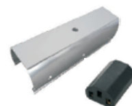
15cm Connect the fixture