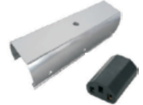
15cm Connect the fixture